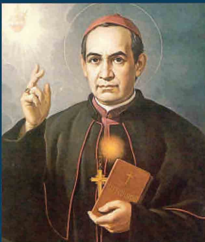
St. Anthony Mary Claret Our Patron