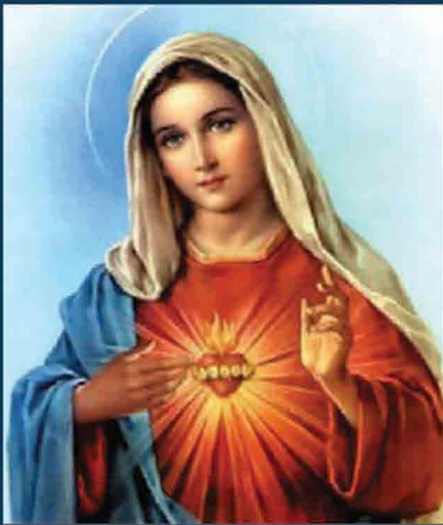
Mother Mary Our Inspiration