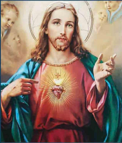
Jesus Christ Our Foundation