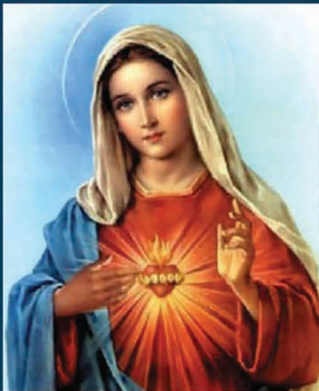
BLESSED VIRGIN MARY OUR INSPIRATION