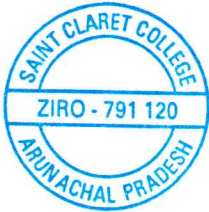
PRINCIPAL Saint Claret College Ziro - 791 120