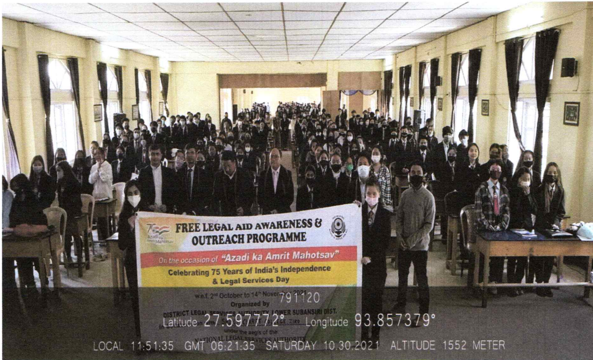
Group Photo (Resource persons, Teaching Faculties and Participants)

Coordinator Sexual Harassment Prevention Cell Saint Claret College Ziro-791120