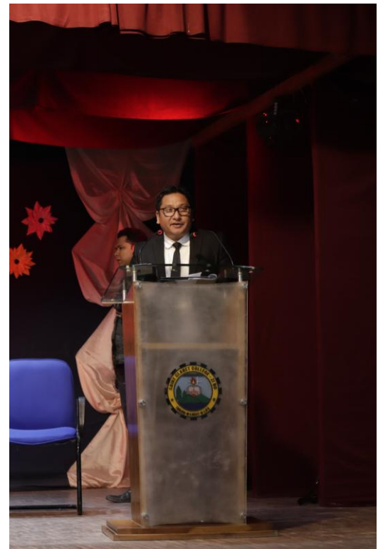
Photos: Speakers & Resource Personnel during Technical Sessions Date: 9 March 2020 || Place: Saint Claret College, Ziro