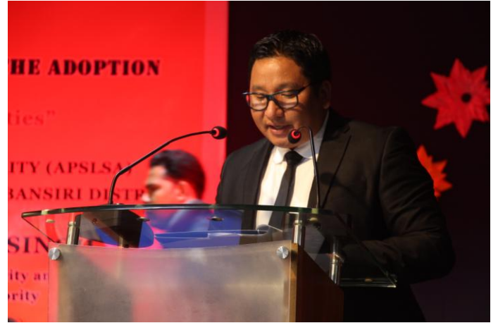
Photos: Speakers during Technical Sessions Date: 9 March 2020 || Place: Saint Claret College, Ziro