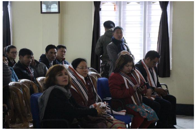
Photos: Participants at the workshop Date: 9 March 2020 || Place: Saint Claret College, Ziro