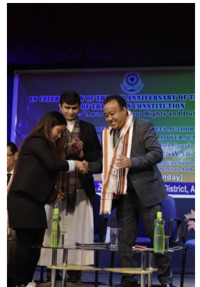
Photos: Welcoming the Dignitaries and Resource Personnel during Inauguration Date: 9 March 2020 || Place: Saint Claret College, Ziro