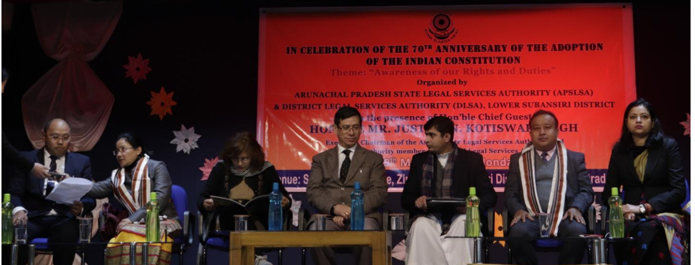
Photos: Dignitaries at the inaugural function Date: 9 March 2020 || Place: Saint Claret College, Ziro