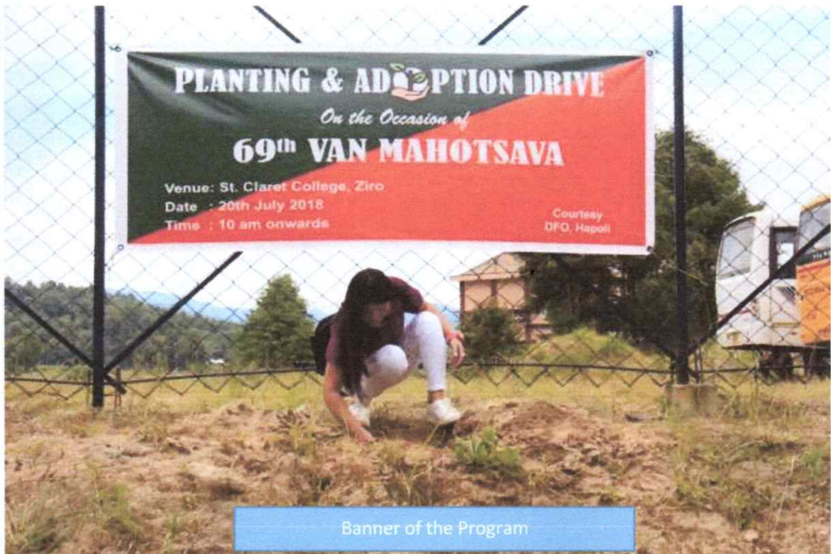
Banner of the Program