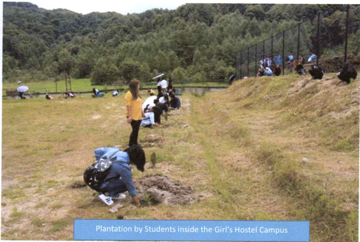
Plantation by Students inside the Girl's Hostel Campus