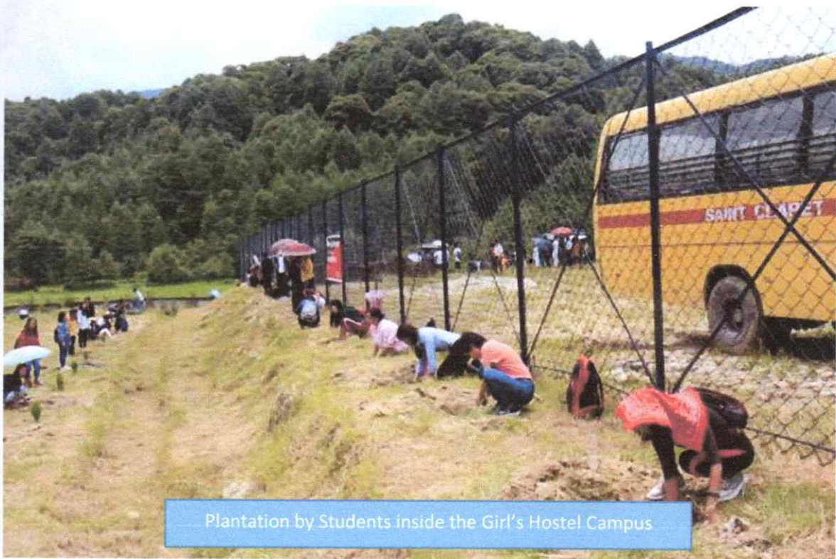
Plantation by Students inside the Girl's Hostel Campus