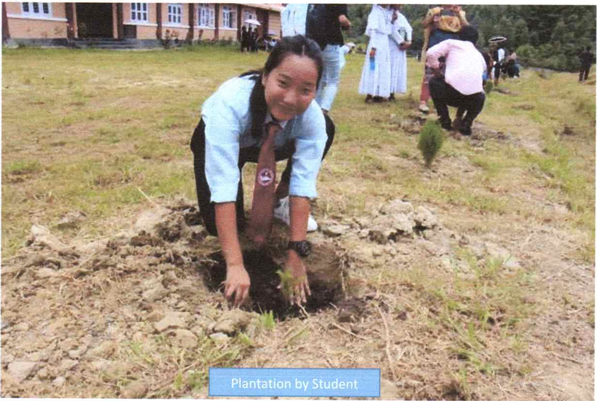
Plantation by Student