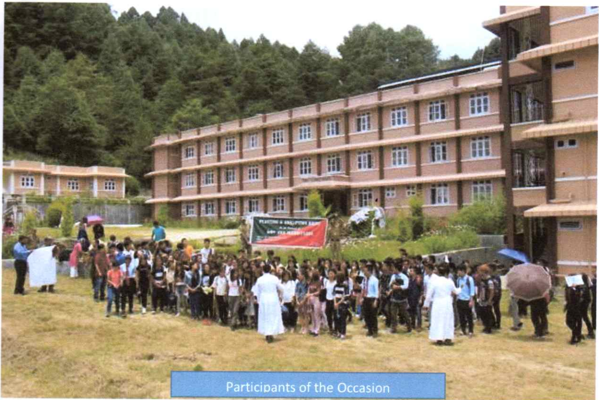
Participants of the Occasion