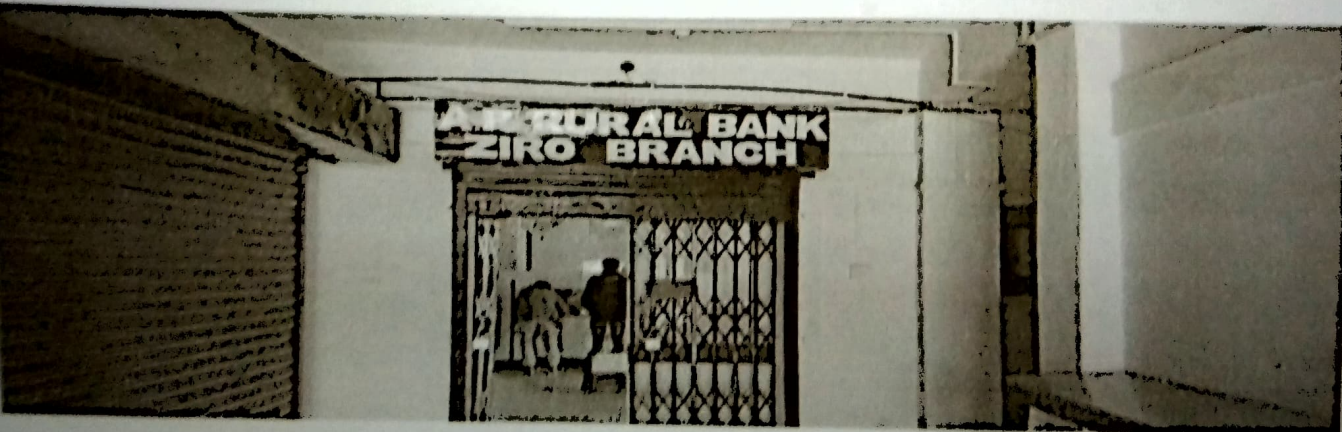
Fig1 Arunachal Pradesh Rural Bank, Ziro Branch