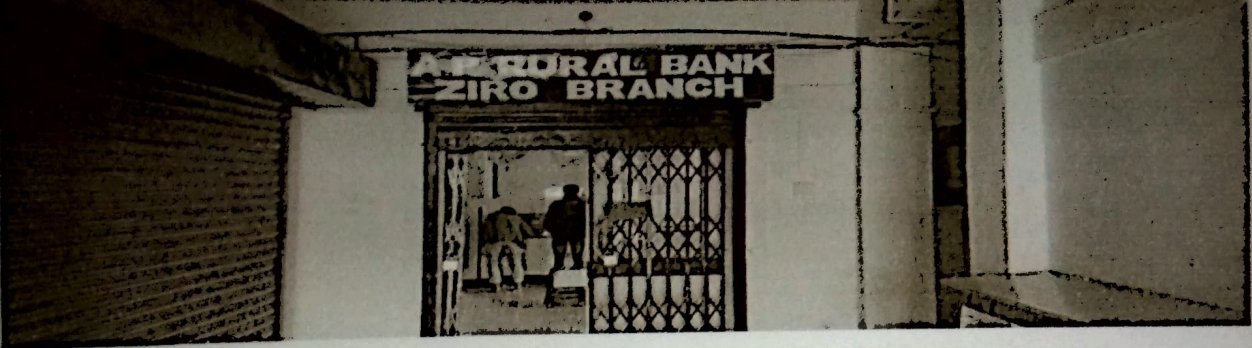
Fig: Arunachal Pradesh Rural Bank, Ziro Branch