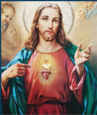
JESUS CHRIST OUR FOUNDATION