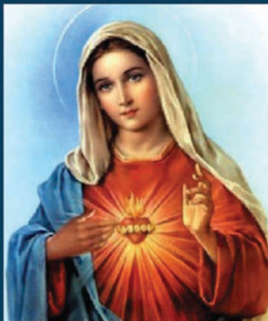
BLESSED VIRGIN MARY OUR INSPIRATION